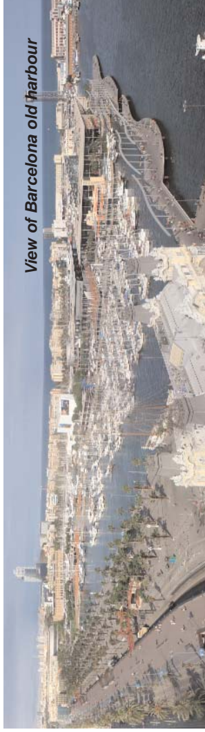
View of Barcelona old harbour