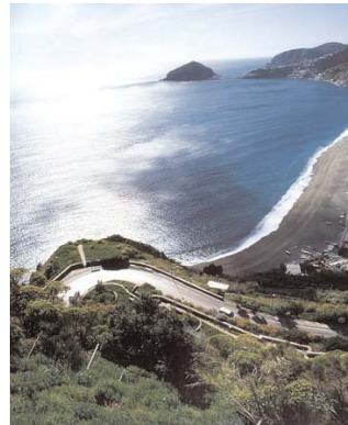
View of Ischia Island