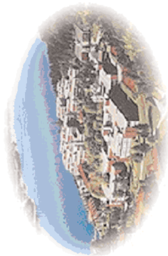
DNV Headquarters, Oslo, Norway